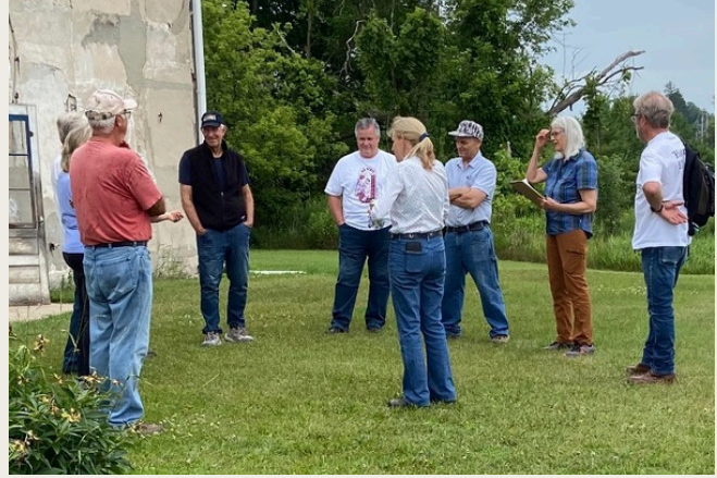
Combined Tour of Saxonia House with Lutze Housebarn