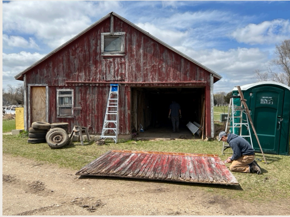
Repairing the Poultry Barn Door