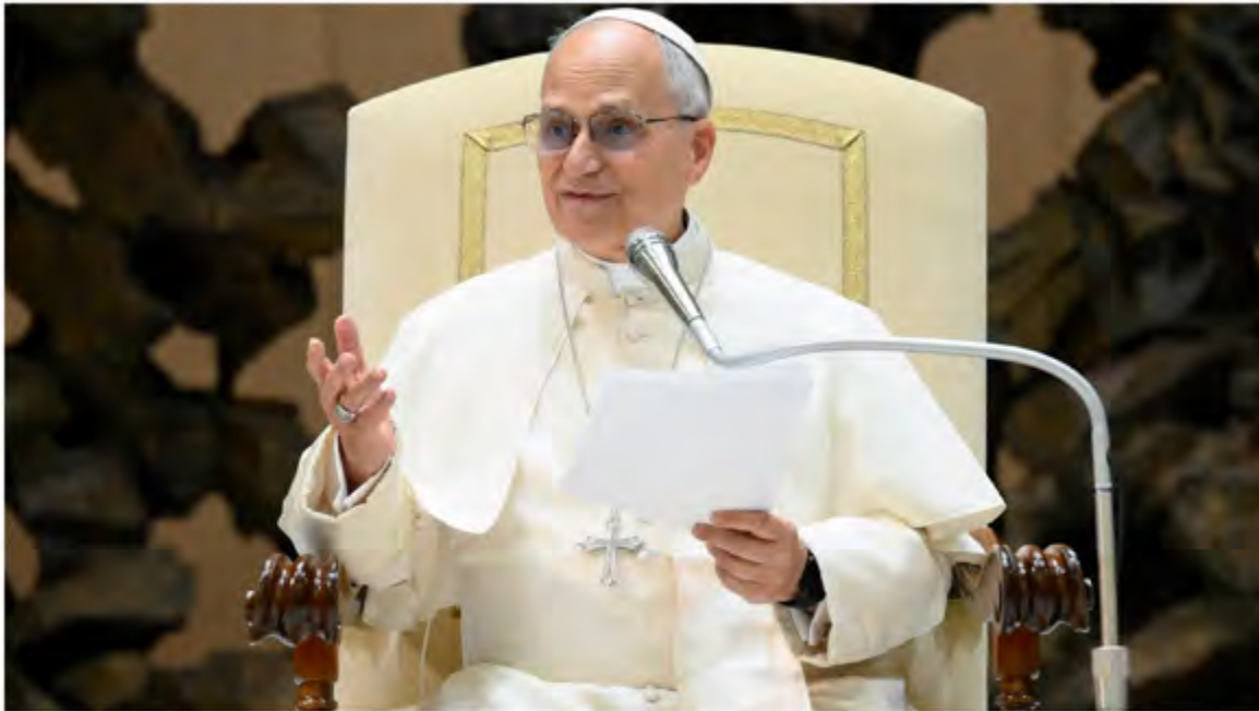
Pope Leo XIV speaks to Vatican employees and their families during his annual pre-Christmas meeting with them in the Paul VI Audience Hall at the Vatican Dec. 22, 2025.