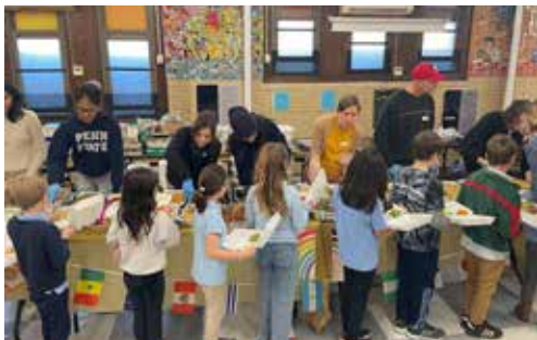
Volunteers serve Meredith Elementary students at Harvest Feast in November

Of course, none of these events and activities would be possible without the support of the community. Neighbors and local businesses continue to be shining stars, donating goods, services and funds to ensure Meredith remains a magnet for years to come. It really does take a village! For more information or to get involved, visit MeredithMatters.org .