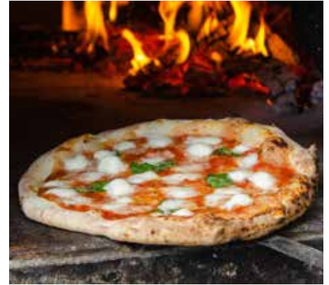
Mmmm!! 'O Sole Mio Pizza!!!

'O Sole Mio's new Bella Vista location offers a larger dining room with areas for private parties and large groups. Sal has brought along his pizza dough recipe from Italy, to South Philly, to our