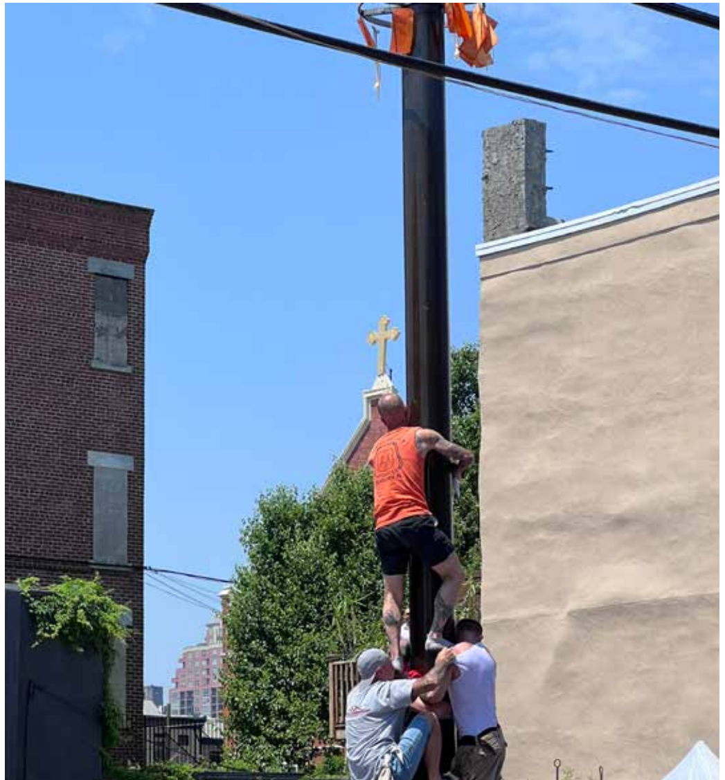
Greased Pole Competition at DiBrunos Brothers Piazza