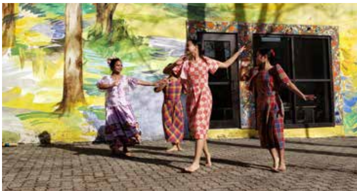
Performance by Filipino dance group, Mutya Dance Company at Palumbo Park on April 1st during the Everyday Futures Fest Launch Party