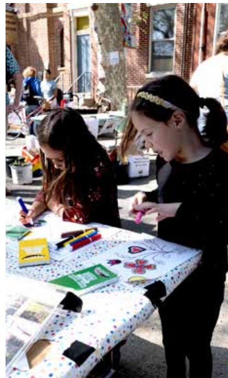
Guests at the 2022 Everyday Futures Fest Block Party

Each year in April, DVAA partners with people all over the city to present a month of free, sustainability focused art and science programs in as many neighborhoods as possible. Last month, they ran 44 workshops, tours, performances, and more with 79 partners. In Philly, we rely so much on the people around us so we can collectively have clean, safe, and healthy spaces. The Everyday Futures Fest highlights people doing that work, teaching audience members about why and how they do what they do. The festival is a space for experimentation, collaboration, and world building, with the intention of envisioning and creating a better future.