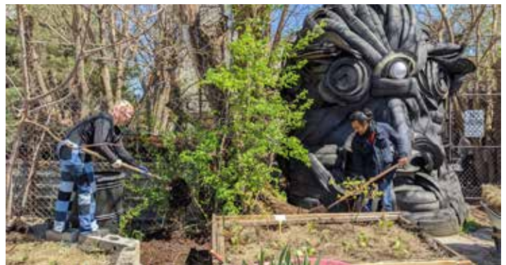
Volunteers joined the 2022 garden cleanup at Open Kitchen Sculpture Garden in Kensington, an annual event during the Everyday Futures Fest