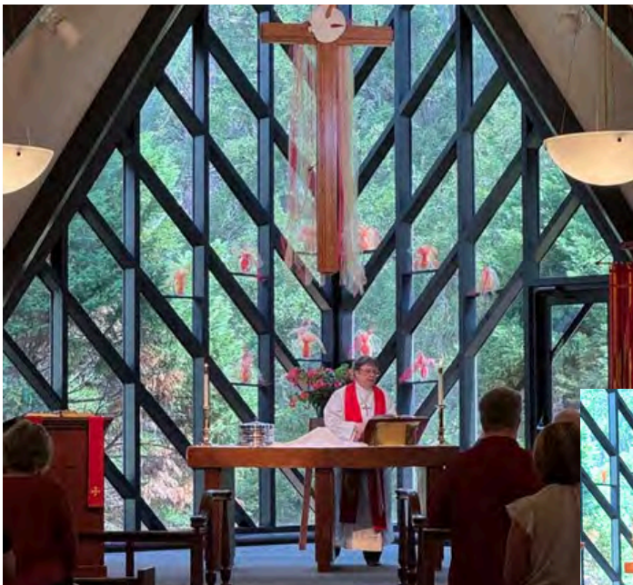
The Spirit at work during Pentecost