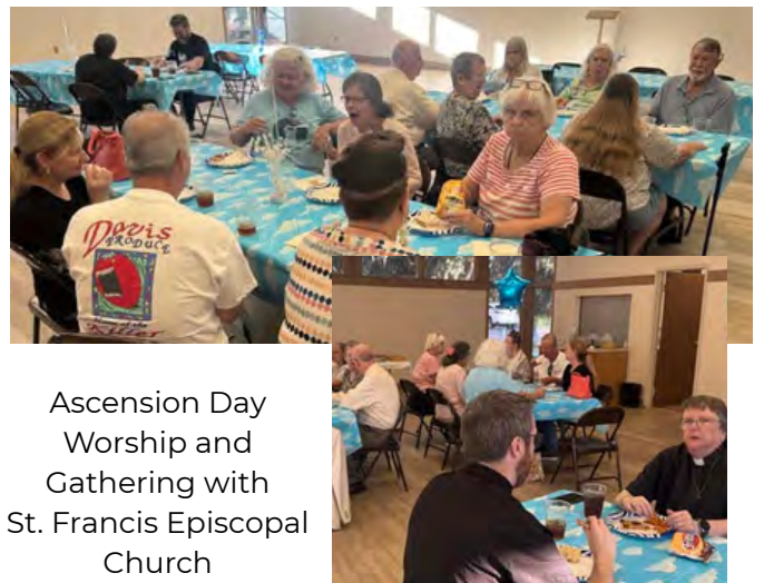
Ascension Day Worship and Gathering with St. Francis Episcopal Church