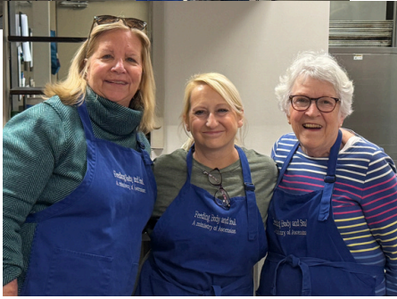
Grace Ministry partners: Redeemer and Lutheran Church of the Ascension