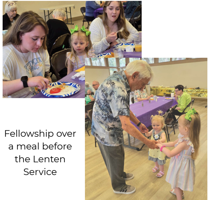
Fellowship over a meal before the Lenten Service