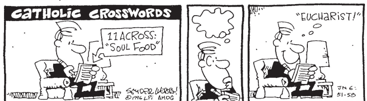
THE BODY & BLOOD OF CHRIST