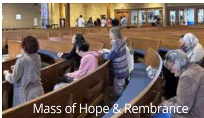
Mass of Hope & Remembrance

It's been a busy month so far . . . 40 Days for Life - Illinois Right to Life's Ground Zero Life Tour Presentation - Rosary for Life - Mass of Hope: Remembering Our Children - National Life Chain - Baby Shower for Walking with Moms in Need - tours at Waterleaf Women's Center & Corbella Clinic. THANK YOU to everyone who has participated with us this month be it through praying, attending, tuning in online, sharing our mission, donating, organizing, or hauling donations!! To anyone who wants to know more about this ministry, please email respectlife.stpeterRLM@gmail.com and request that we add you to our Flocknote distribution list.