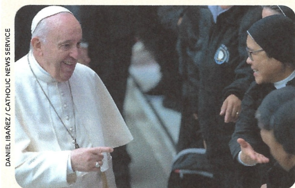
DANIEL IBAÑEZ / CATHOLIC NEWS SERVICE