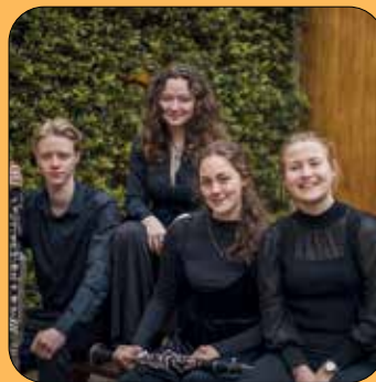
THURSDAY 14 MAY The Hyde Clarinet Quartet Lago, Borodin, Beethoven, Forrest