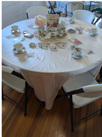
Stepping Back In Time Hansen House Senior Living