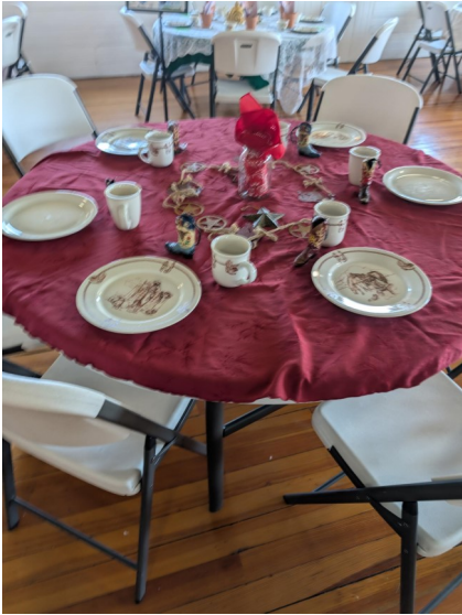
Cowboy Up Shelby Co Chamber