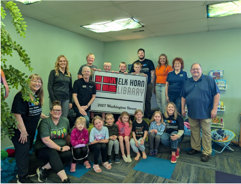
Monday, April 20, 2026 Elk Horn Public Library

A time to celebrate the essential roles libraries, librarians, and library staff play in transforming lives and strengthening communities.