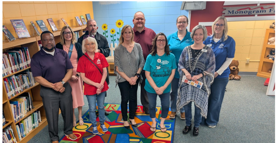
Tuesday, April 21, 2026 Harlan Community Library