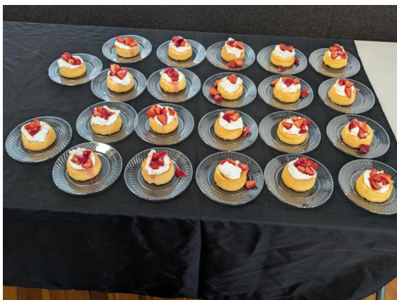
Delicious Desserts Provided By HGCC