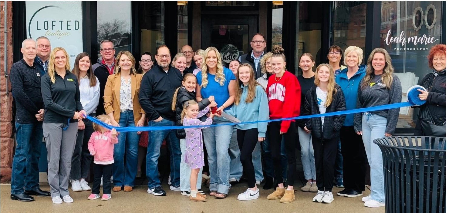
Friday, April 3, 2026 - Lofted Boutique, 1024 6th Street, Harlan Celebrating Their One Year Anniversary