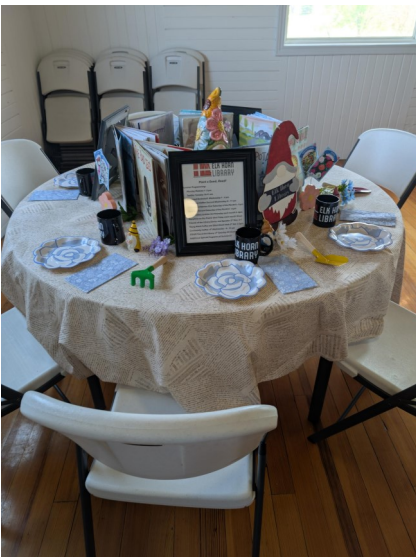
Garden of Learning Elk Horn Public Library

Here is the link to the video of all the tables, courtesy of Harlan Golf & Country Club