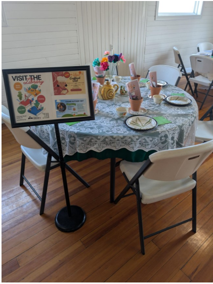
Plant A Seed, Read Harlan Community Library