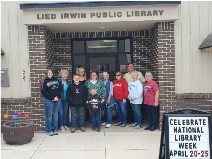
Thursday, April 23, 2026 Lied Irwin Public Library