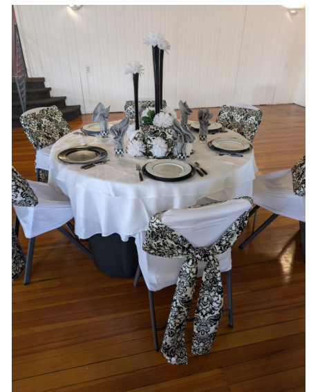
Making Memories HGCC Ladies Golf & Social