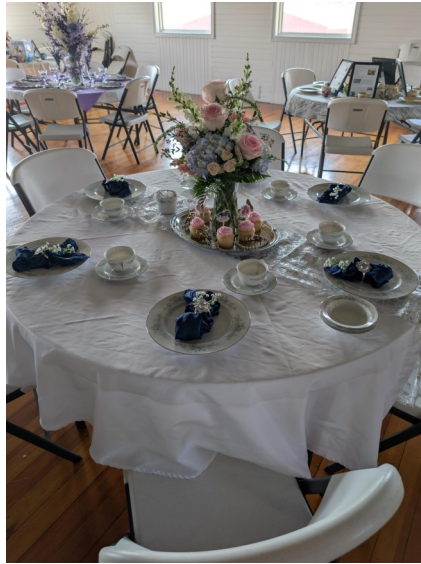
Derby Day Tea Party Elm Crest Senior Living