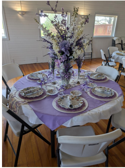
Purple & Lavender Harlan Theatre