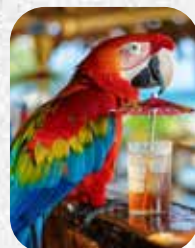
Open Positions Social Media Historian