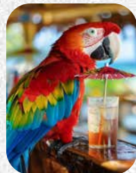
Open Positions Social Media Historian