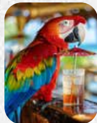
Open Positions Vice President