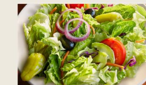
Famous House Salad without croutons