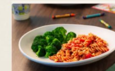
Kids Rotini with Marinara