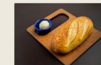
Extra Loaf Of Bread