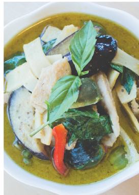
25. GREEN CURRY

Comes with Chicken, Beef or Tofu | Shrimp Served with Jasmine Rice