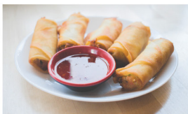
2. VEGGIE EGGROLLS (5 PCS)