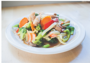
14. PAD RUAMMIT