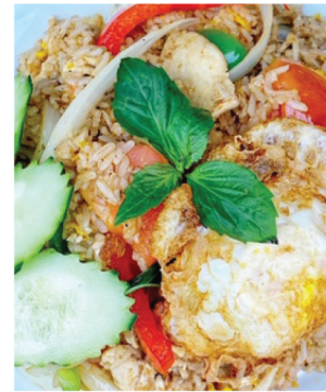
30. BASIL FRIED RICE