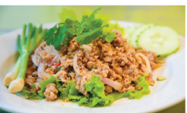
9. LARB GAI