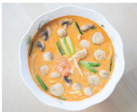
11. TOM KHA