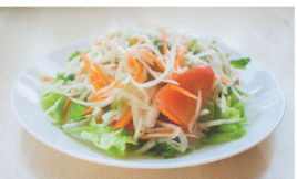
7. PAPAYA SALAD