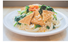
22. THAI FRIED RICE