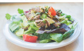
8. TOFU OR BEEF SALAD