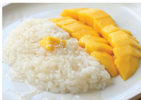
SWEET STICKY RICE WITH MANGO