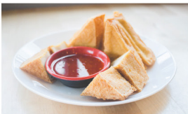
4. TOFU TOD (6 PCS)