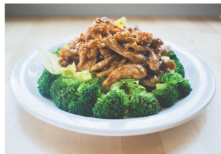
17. PAD GARLIC BLACK PEPPER