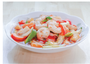
36. PAD PREAW WAN