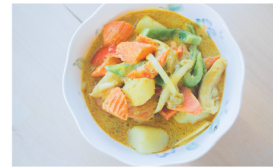
26. YELLOW CURRY