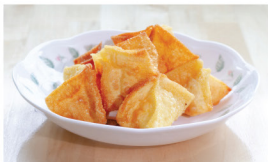
6. CRAB RANGOON (5 PCS)