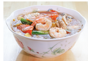
35. RAD NA