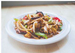
16. PAD CASHEW NUTS