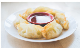
1. POT STICKERS (7 PCS)