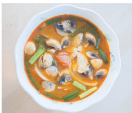
10. TOM YUM