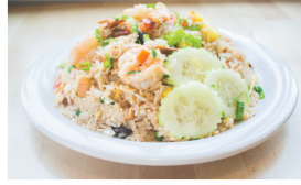
23. PINEAPPLE RICE