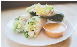
3. THAI SALAD ROLLS (2 PCS)