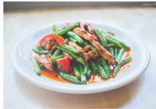
13. PAD PRIK KING