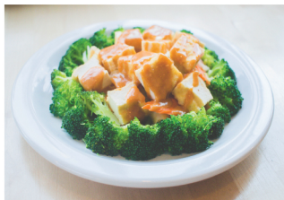
18. STEAMED VEGETABLES