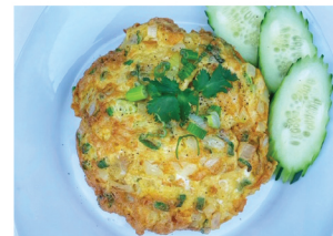
34. THAI STYLE OMELET