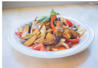
15. PAD PHET