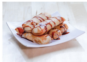
FRIED BANANA (6 PCS)