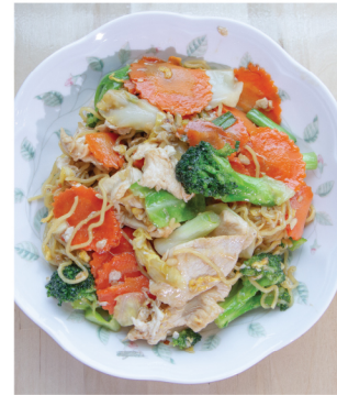
33. YAKISOBA NOODLE SOUP