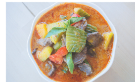
28. PUMPKIN CURRY