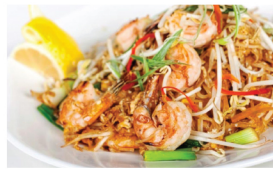
19. PAD THAI

Comes with Chicken, Beef or Tofu | Shrimp