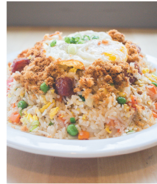
31. SUNFLOWERS FRIED RICE