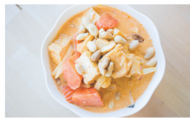
27. MUSSAMAN CURRY