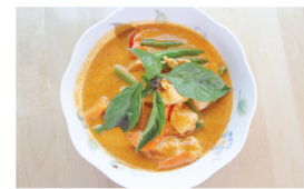
29. PANANG CURRY