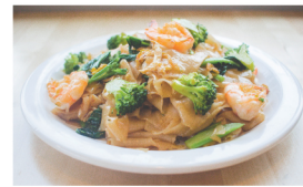
20. PAD SEE EW