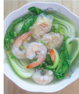
32. SHRIMP WONTON SOUP