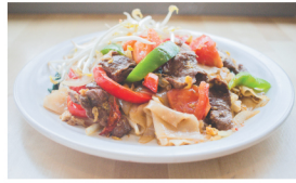
21. PAD KEE MAO