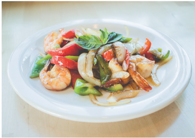
12. PAD KA PRAO

Comes with Chicken, Beef or Tofu | Shrimp