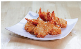
5. COCONUT SHRIMP (5 PCS)