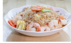
24. PAD WOON SEN