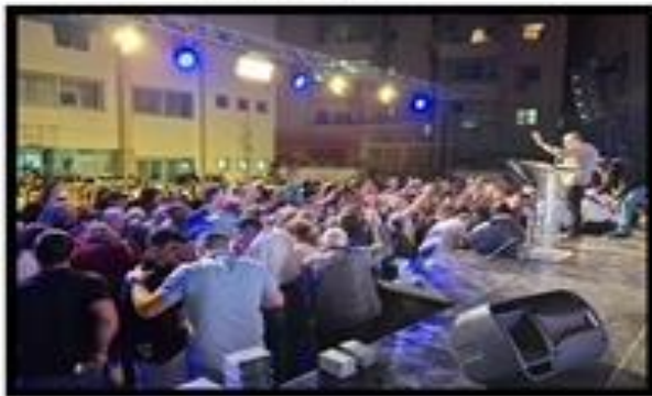
A GREAT RESPONSE!