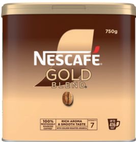
Nescafé Gold Blend

NESCAFÉ® Original Granules 750g is rich and fully flavoured. Made using 100% responsibly sourced coffee beans, nothing else, you'll get plenty of taste and aroma in every cup from this 750g coffee tin of NESCAFÉ® Original Granules. NESCAFÉ® Original Granules 750g tin brings the instant, delicious and authentic flavour of NESCAFÉ® Original coffee to you, perfect for serving to customers, or as a coffee break offering for your workplace. Nestlé Professional. A 8200 6x750g £33.53 £201.18