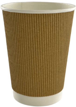
12oz Kraft Ripple Cup

Zilk's plant-based barista range is a great way to offer more choice. Available in Oat, Soya, and Coconut, each one is crafted to steam smoothly, pour beautifully, and complement coffee with a creamy texture and balanced taste. With more customers seeking dairy-free options for health, lifestyle, or environmental reasons, Zilk helps you meet that demand - without compromising on quality.