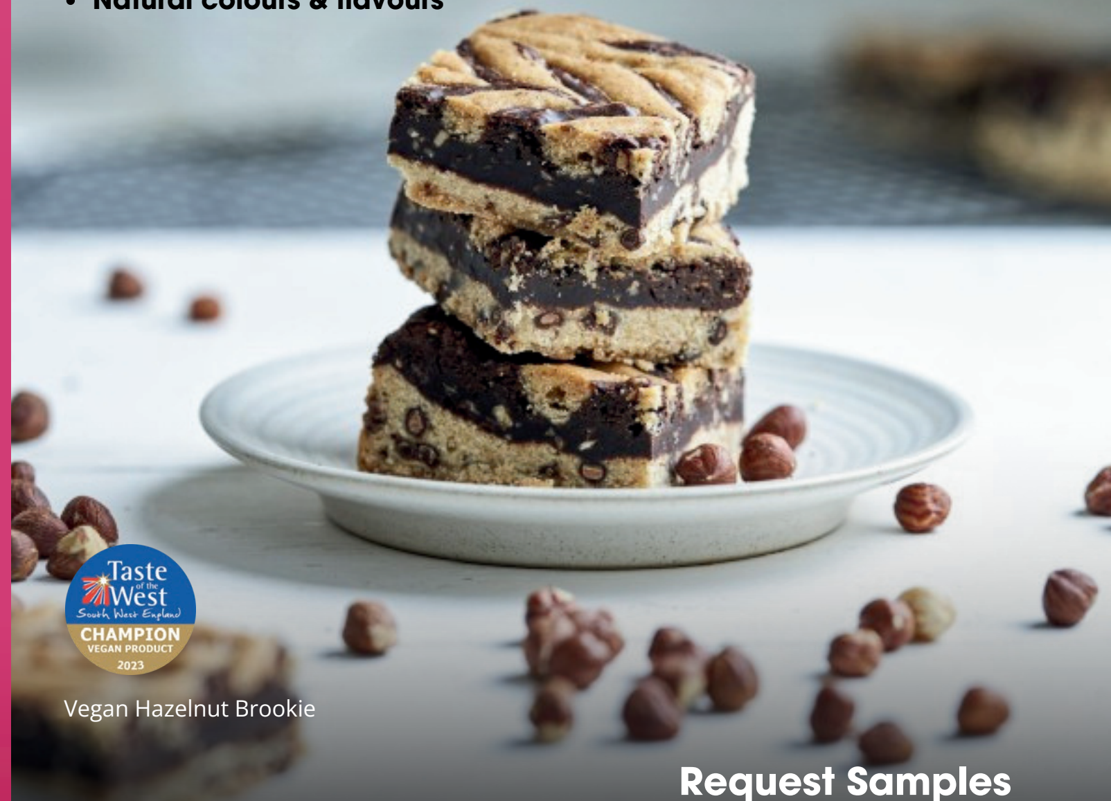
Vegan Hazelnut Brookie