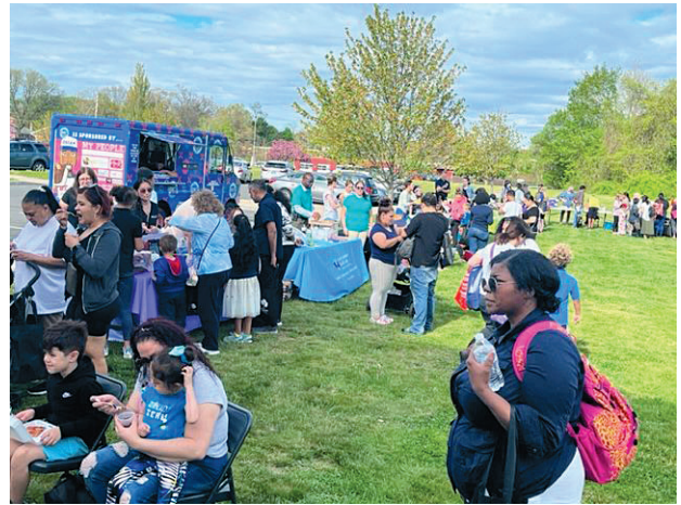
Our very first East Hartford Healthy Community Connections event was a huge success!

Fiscal year 2022 could best be described as a year of growth, expansion, impact, and firsts. After years of deliberation and strategic planning, InterCommunity transitioned its development committee to a Development and Marketing Department. We now have a greater focus on enhancing our development, marketing, and communications strategies to align more closely to our mission and business values, and ensure a greater return on our investment in paid advertisements and community education activities.