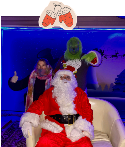
Bozak Christmas Lights