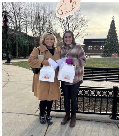
Cookie Walk Guests