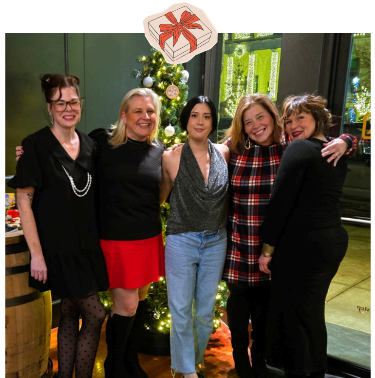
Holiday Staff Party at Peddlers