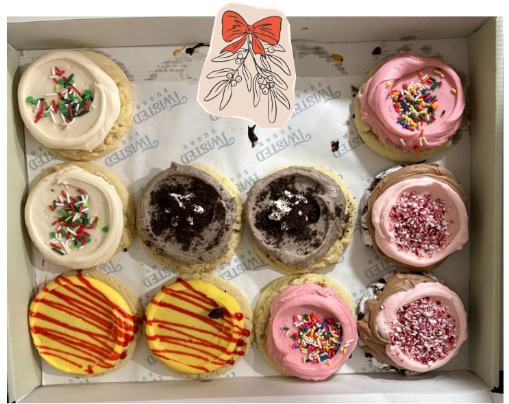
Treats donated from Twisted Sugar in Valpo