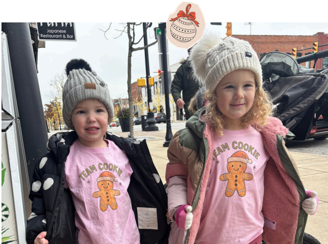
The Caring Place Cookie Walk