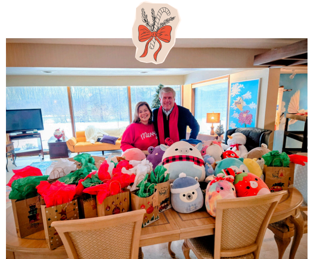
Thrivent donated Squishmallows