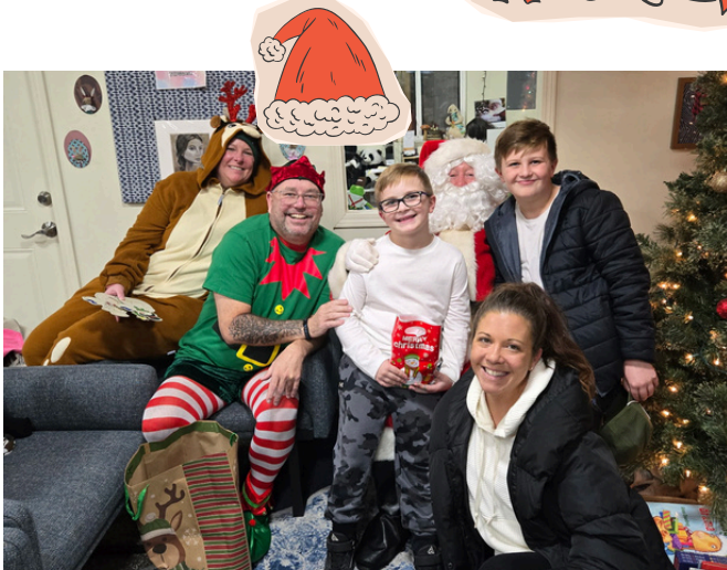
Holiday House Party at The Caring Place