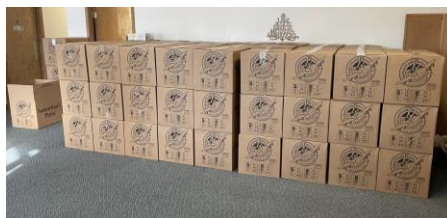
Photo above: All the boxes that have been dropped off in Sidney, packed up ready to go (approx. 1,500 boxes)! Photo below: All the boxes from Watford City Area Lutheran P.arish (over 50 boxes)! $440 was donated for postage.

A HUGE thank you to everyone who participated in the Operation Christmas Child project this year! Over 50 boxes were collected and $440 was donated for postage.