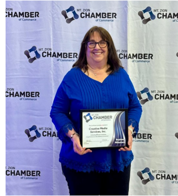
Creative Media Services—25