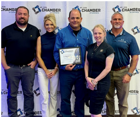
J. J. Swartz Co.—105