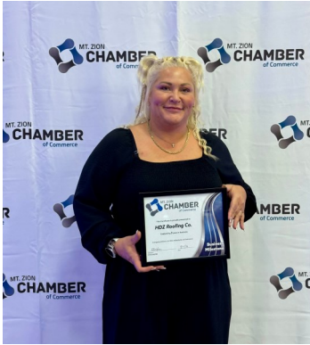
HDZ Roofing Co.—5