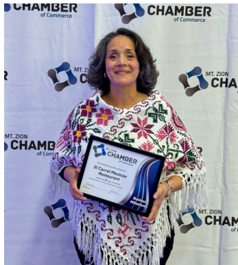
El Corral Mexican Restaurant—20