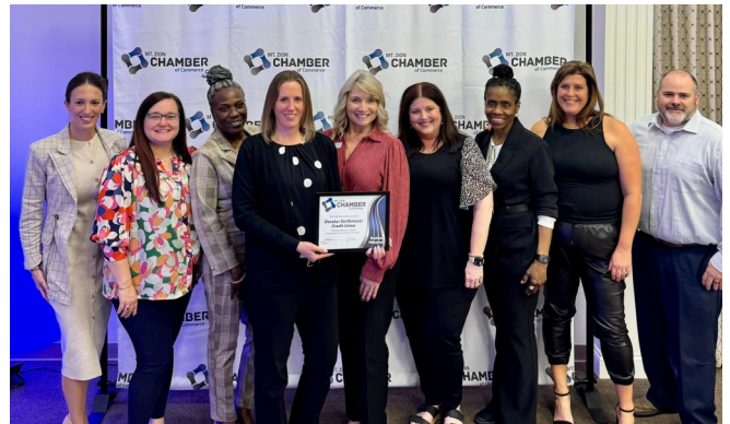
Decatur Earthmover Credit Union—70