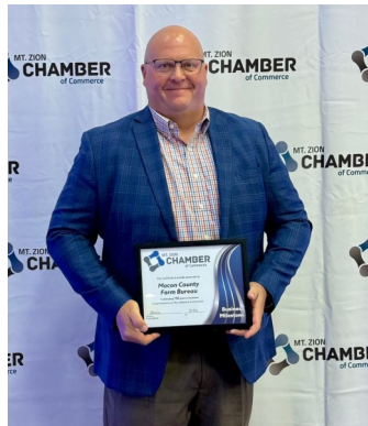
Macon County Farm Bureau—110