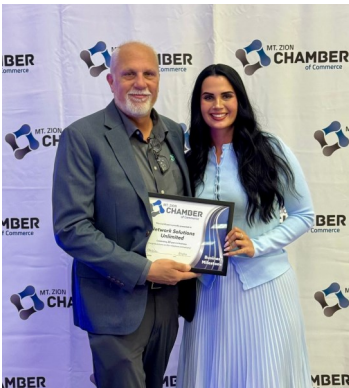
Network Solutions Unlimited—25