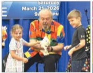
The family-friendly free Expo & Taste was held this past Saturday at the Mt. Zion Convention Center featuring close to 40 local exhibitors. An Easter Egg Hunt, face painting, pictures with the Easter Bunny, food vendors, stage entertainment and activities for all ages were enjoyed by those in attendance. Taste vendors included Refreshment Services Pepsi, Co's,