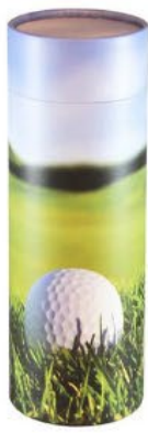
19 th Hole