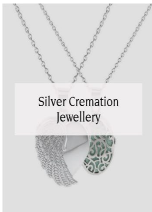
Silver Cremation Jewellery