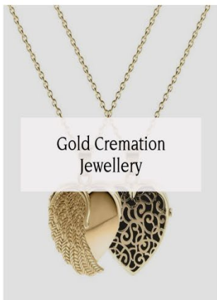
Gold Cremation Jewellery