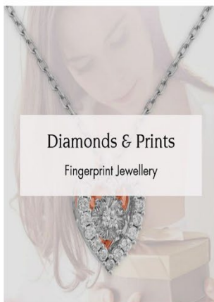
Diamonds & Prints Fingerprint Jewellery