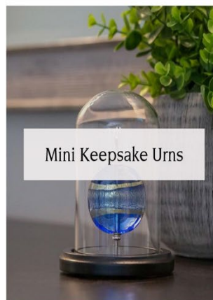
Mini Keepsake Urns