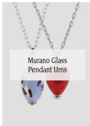
Murano Glass Pendant Urns