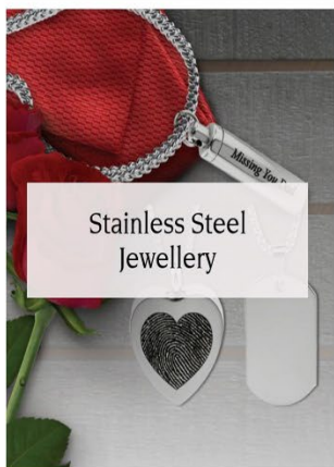
Stainless Steel Jewellery