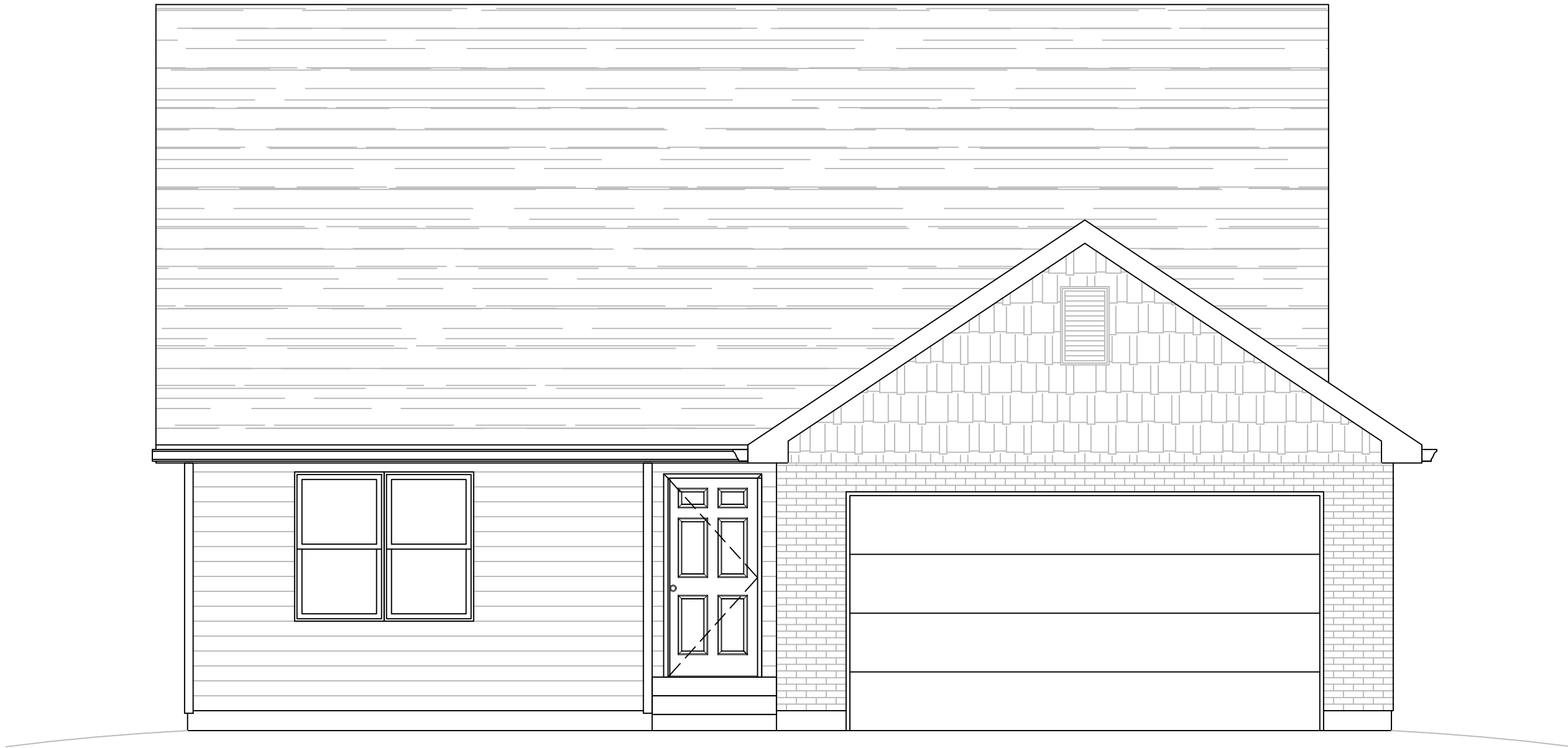
PROPOSED FRONT ELEVATION SCALE: 1/4" = 1'-0"