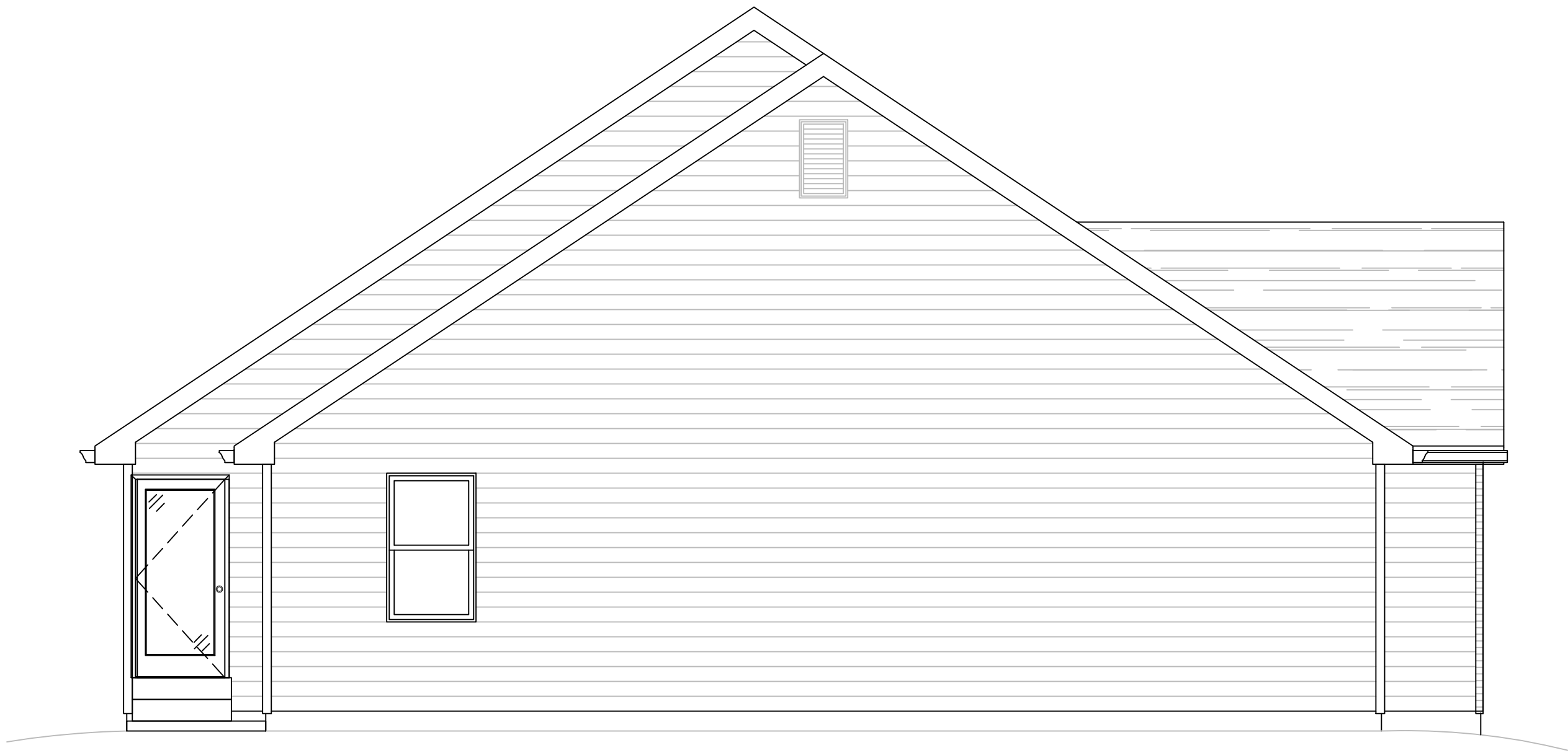
PROPOSED PLAN WEST ELEVATION SCALE: 1/4" = 1'-0"