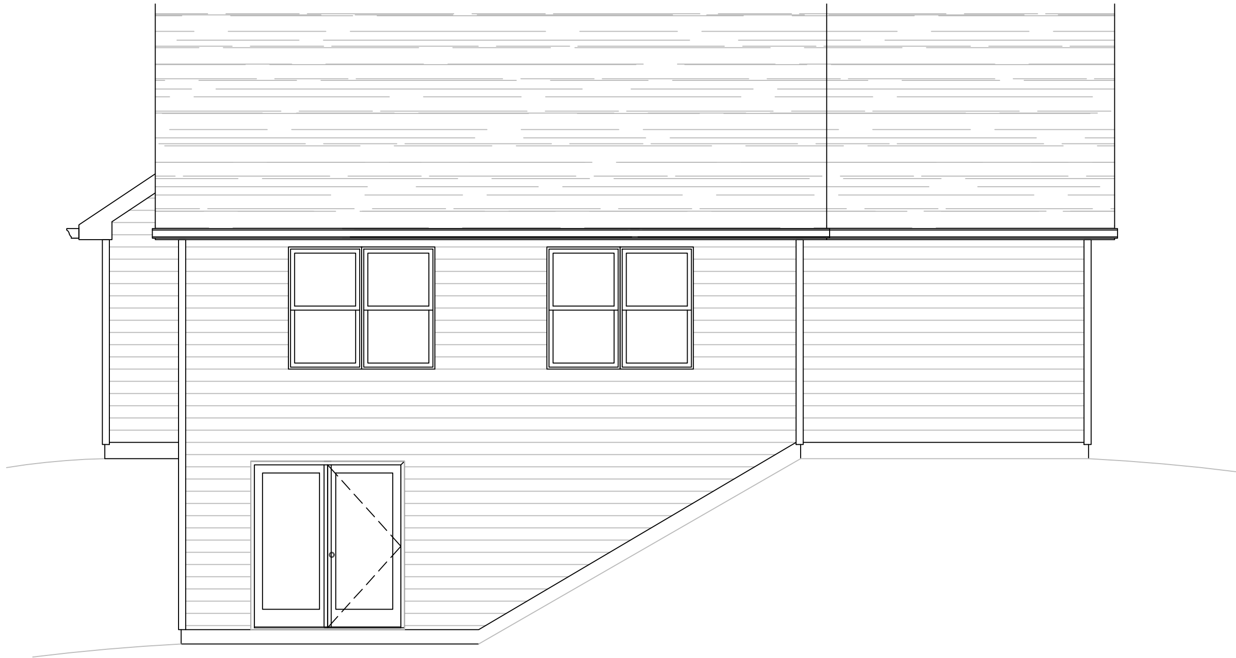
PROPOSED REAR ELEVATION SCALE: 1/4" = 1'-0"