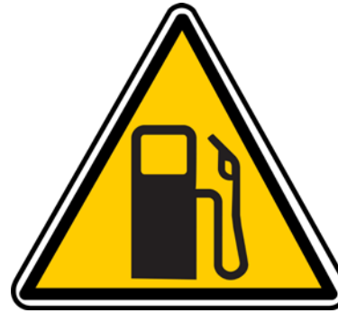
Gasoline & Jet Fuel Spills