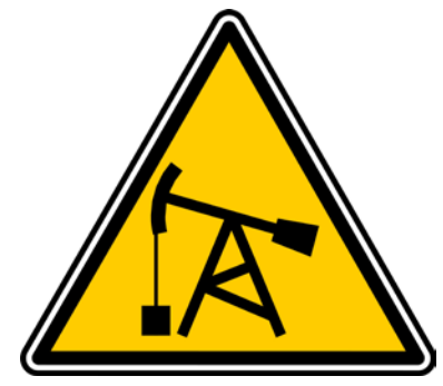
Environmental & Industrial Spills