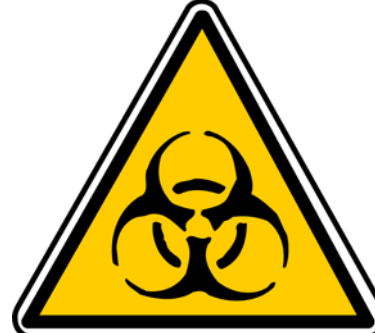
Blood & Bodily Fluids