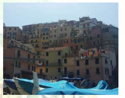
The 12 Day Treasures of Lombardy, Piedmont and Liguria Tour costs AUD $8,040.00 per person, twin share (AUD$1090.00 Single Supplement) and includes: