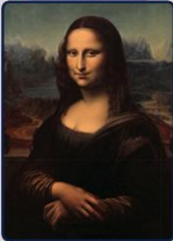
Mona Lisa (1503-06)