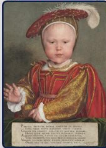
Edward VI as a Child (1538)