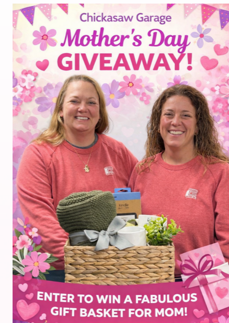
ENTER TO WIN A FABULOUS GIFT BASKET FOR MOM!