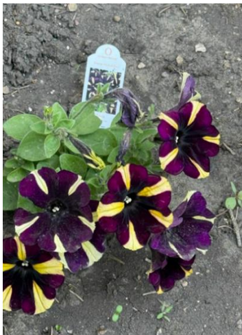
Pansies and petunias were added to give colour and variety.