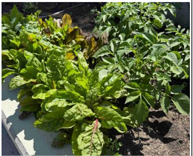
In addition to perennial and annual ornamental plants and flowers, the Church School children and teachers have planted a variety of vegetables, including chard, lettuce and potatoes (shown above).