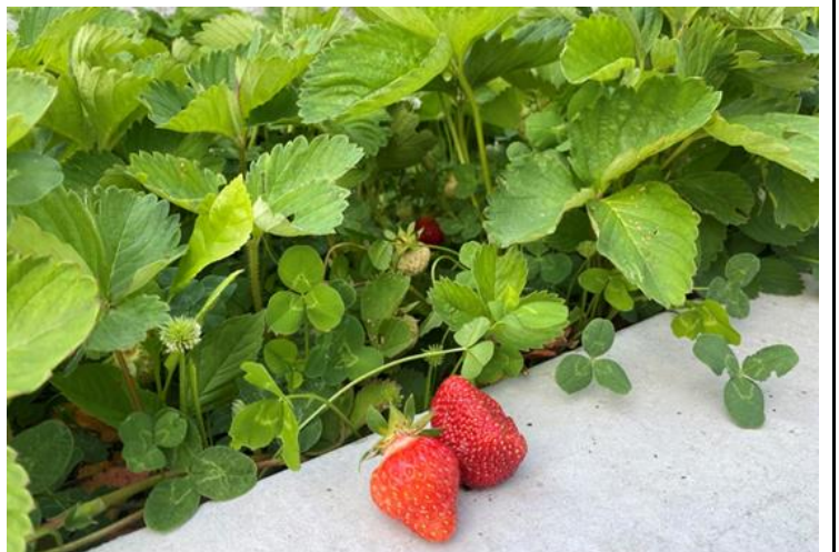
Our perennial strawberry patch is bursting with berries now!

You are invited to stop and enjoy the gardens in person whenever you are at the church!