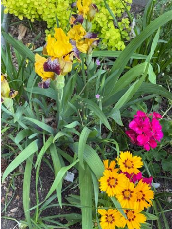
Roses, irises and yellow coreopsis plants have followed, with geraniums planted.