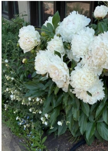
Early on, several bleeding-heart plants were in bloom in the front of the church. Then the peonies came along the west side of the building.