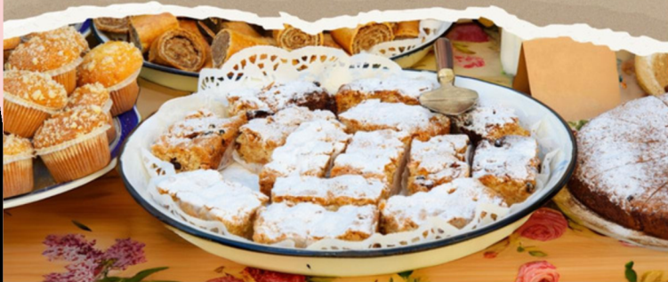
Angela Waller Catering Out the Box, LLC