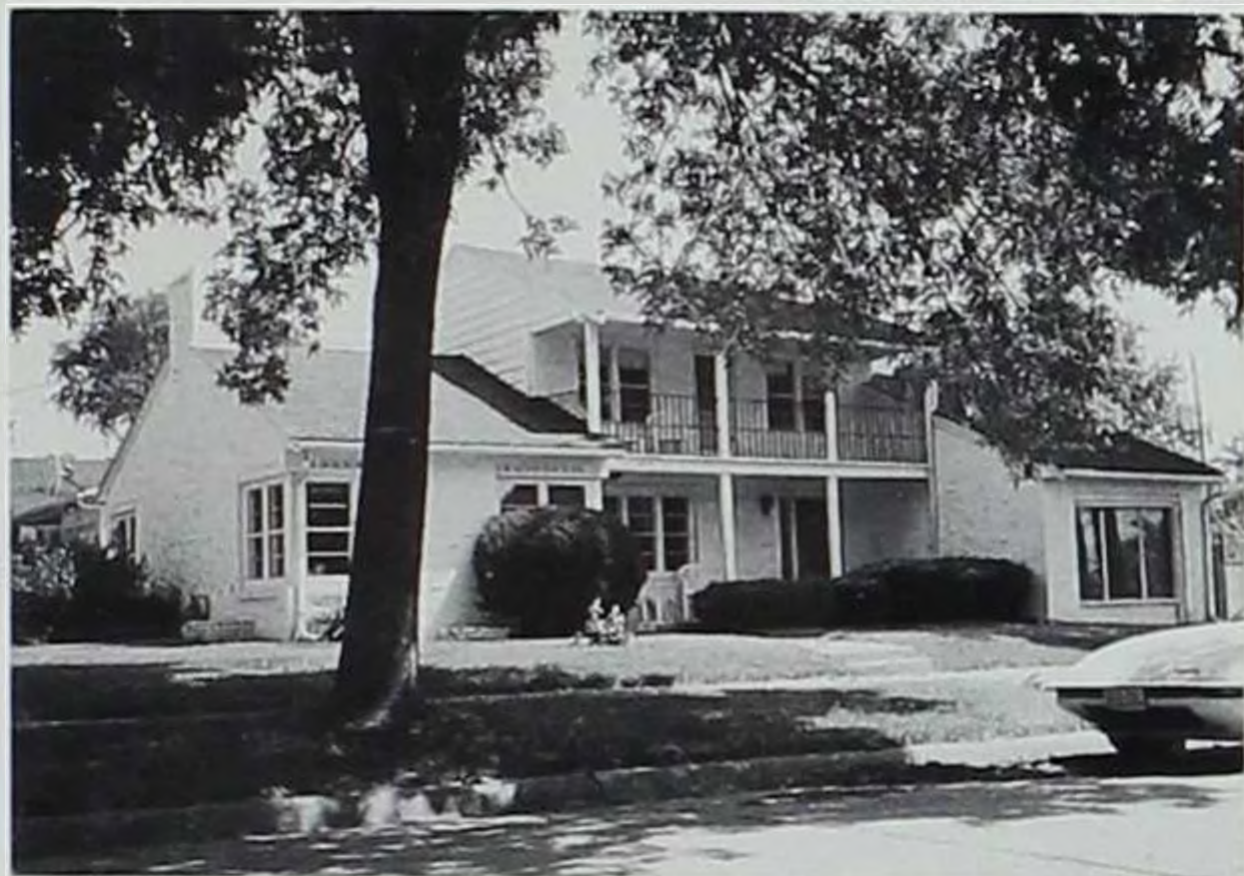
This 1938 home departs from Moffitt's cottage look and hints at the International Style's clean, open lines.

this Moffitt house, the convex-shaped, hipped roof and a wood-shingle pattern create an especially strong appearance of a thatched roof.