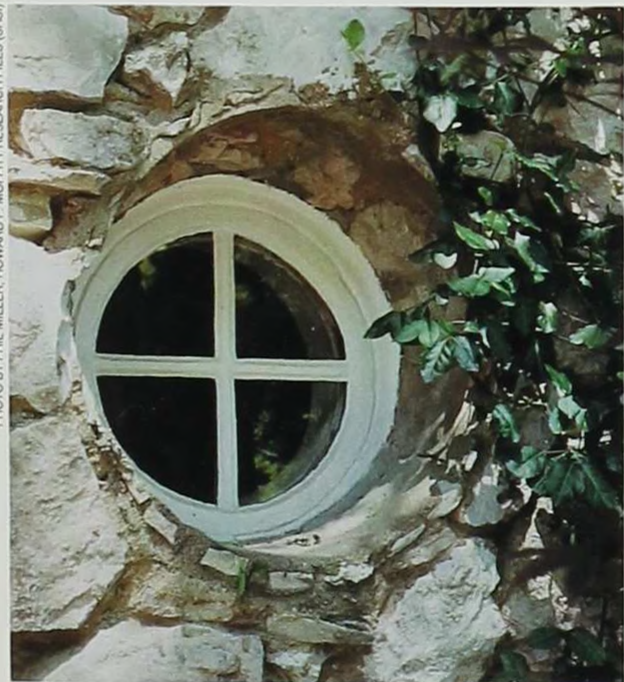
Vines frame a salvaged window in an exterior wall. For another view of this home, see page 159.