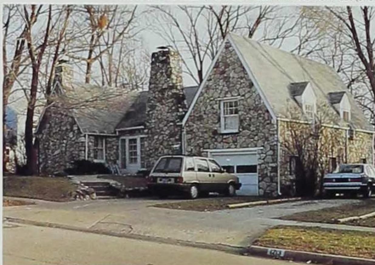
Another 1938 house shows Moffitt's continued use of stone, steeply pitched roofs, and dominant chimney.