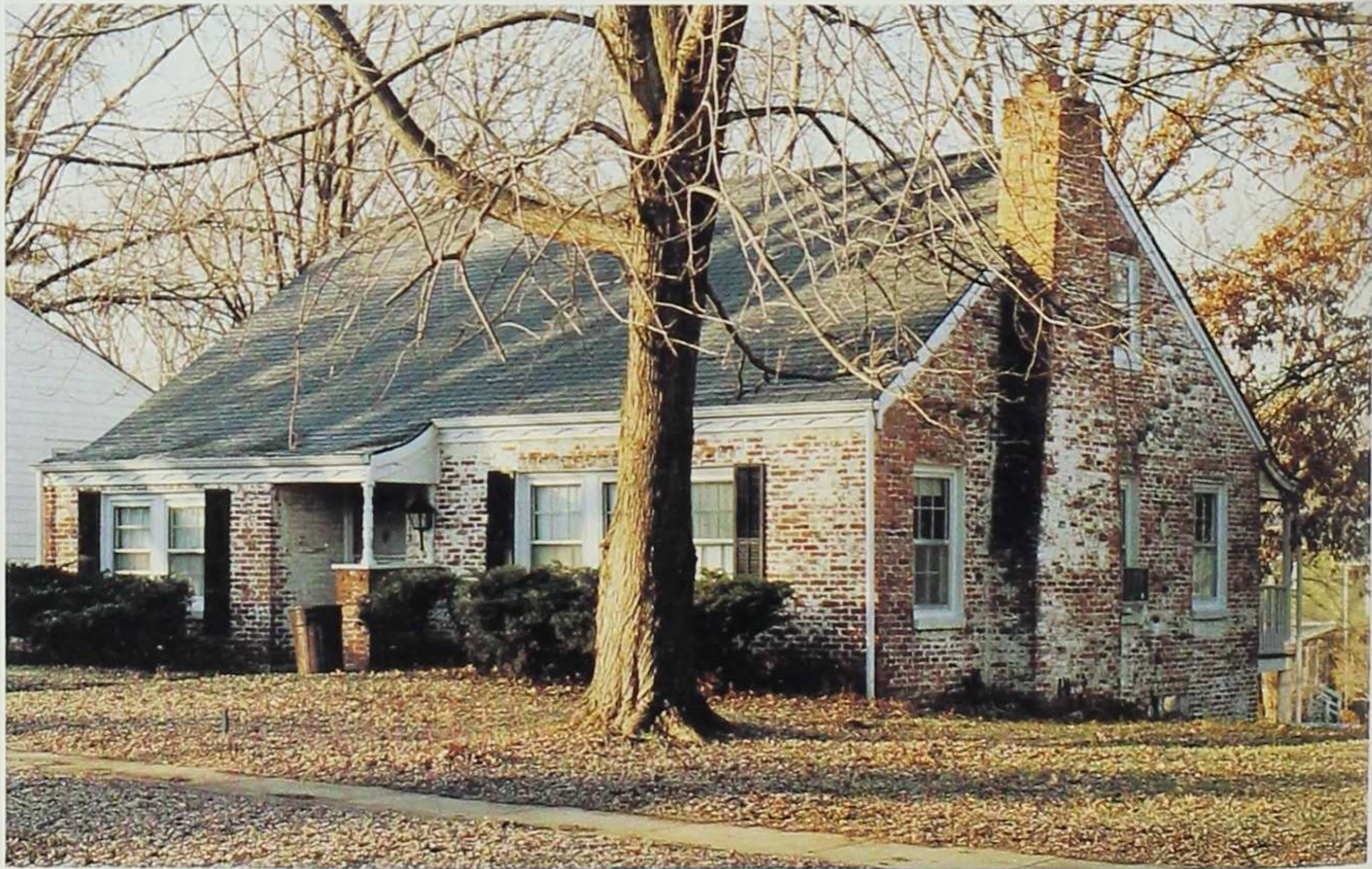
Just visible under the eaves, the row of shallow scallops is actually made from the uppermost part of chair backs. Moffitt often used salvaged materials for architectural details.