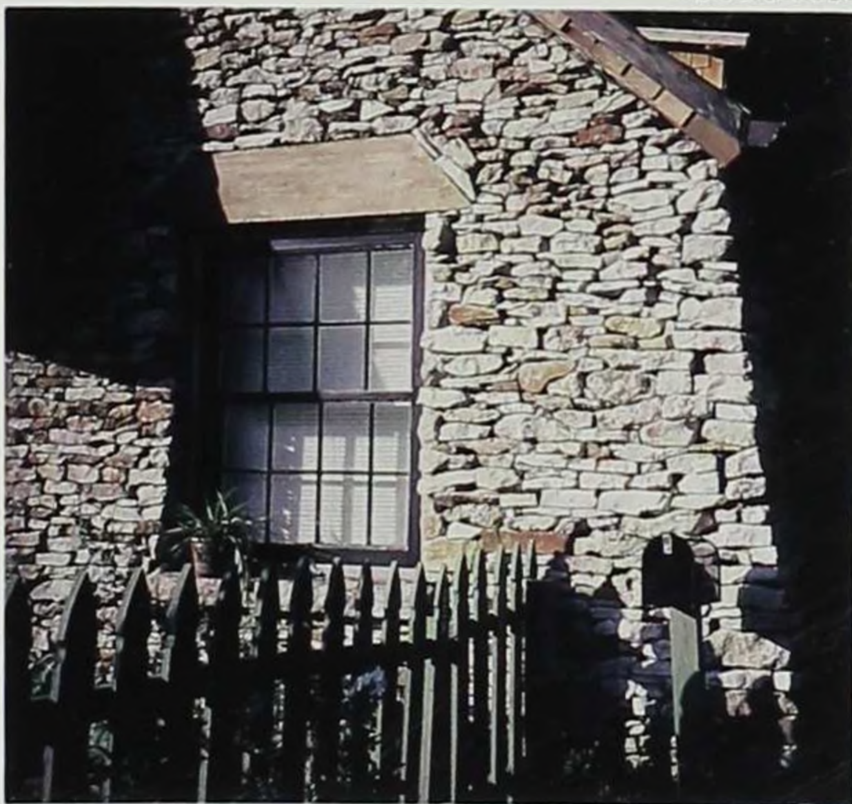
In 1939/40 Moffitt built a row of five stone cottages, each with distinctive and labor-intensive stonework. Above, an example.