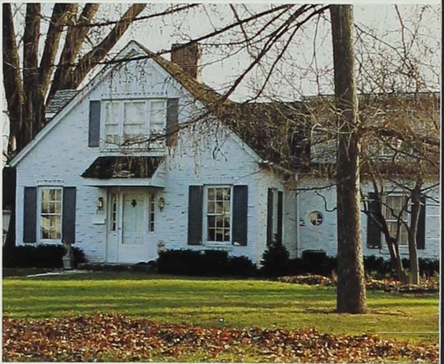
Moffitt bought this house, added wings and a brick exterior (using the header ends of the brick for texture and trim). The Moffitts lived here in the 1940s.

This time, however, Moffitt's luck ran dry. Additional irrigation trenches were not completed on time. Faced with this calamity, the two men tried to truck in water to keep the fruit trees alive, but they lacked sufficient water rights. They had to use run-off water from other irrigation systems. Perhaps the men