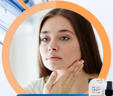
Skin + Lips