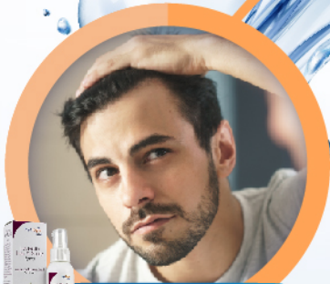
Hair & Scalp