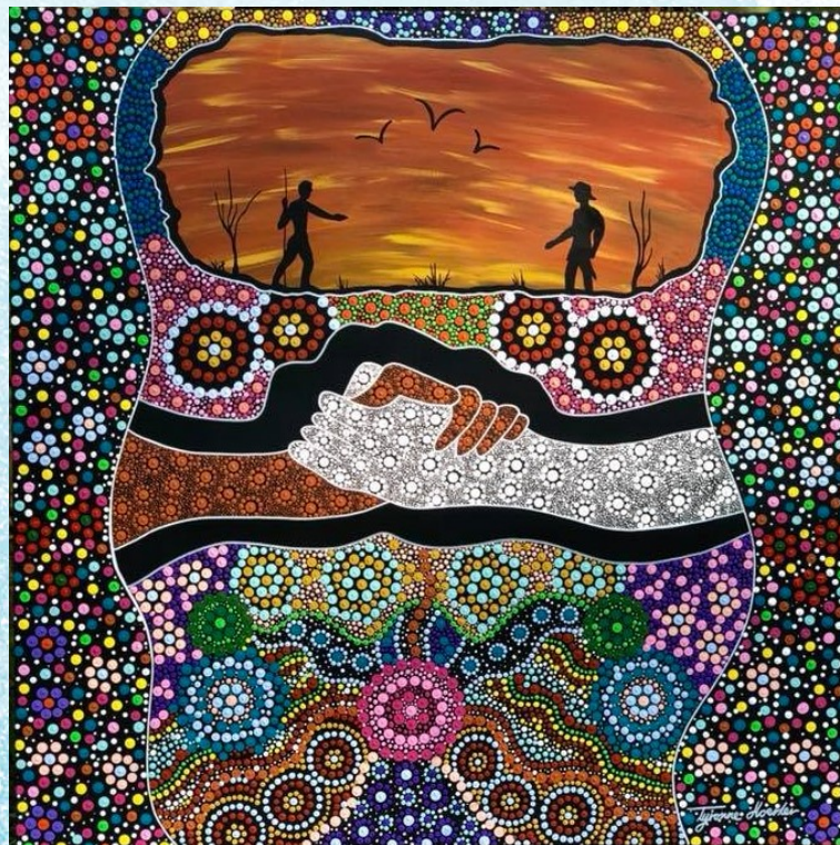
It's Up to Us by Tyronne Hoerler