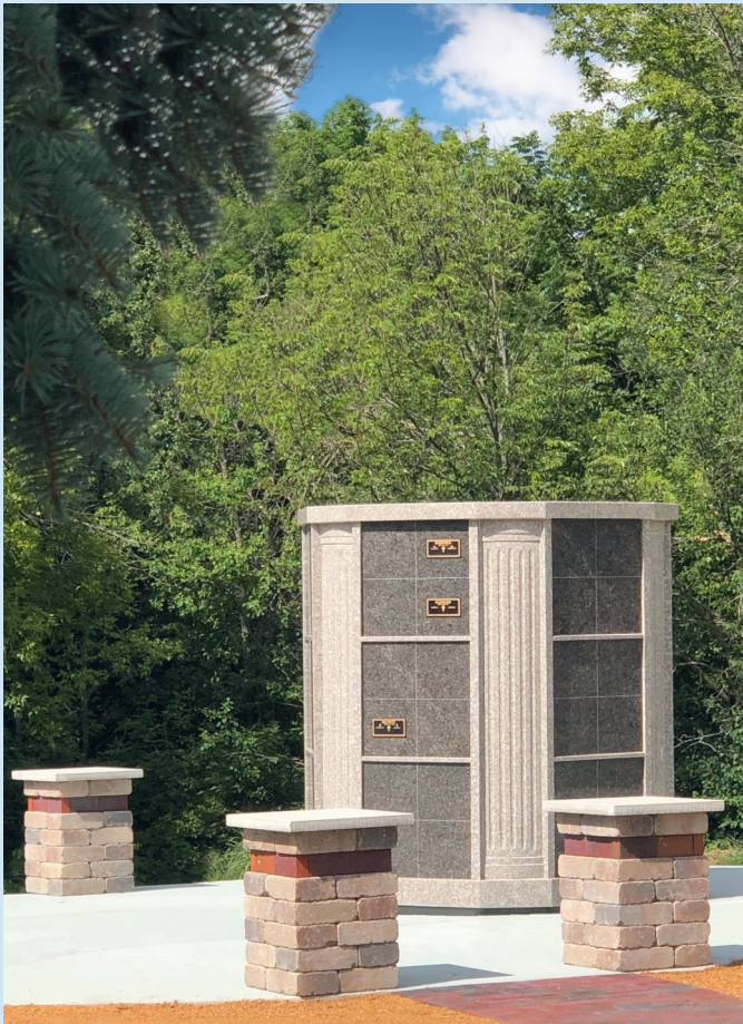
St. Clare Cemetery, Town of Merton