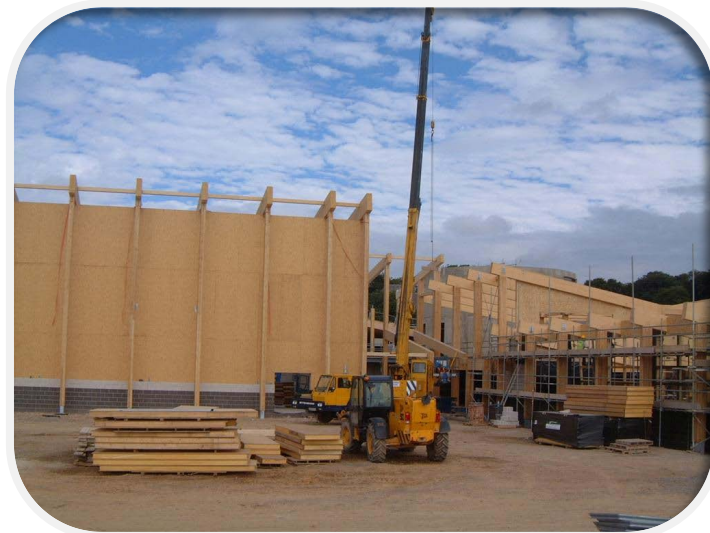
View of Hemsec Sips installed between glulam frames to Sports Hall.