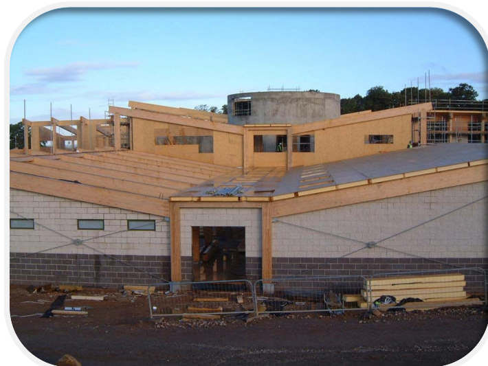
View of Hemsec SIPs roof being installed over the glulam frames.