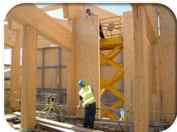
Hemsec SIPs being installed between glulam frames.