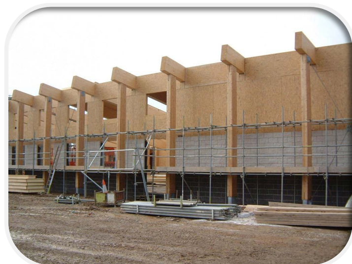
View of Hemsec Sips installed between glulam frames to Sports Hall.