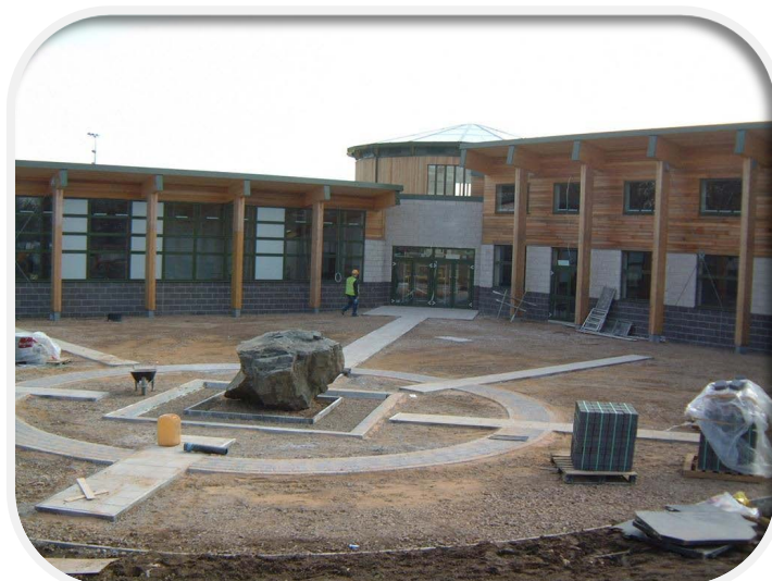
View of the front entrance near to completion.