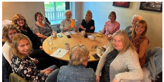
Next Monthly Meeting