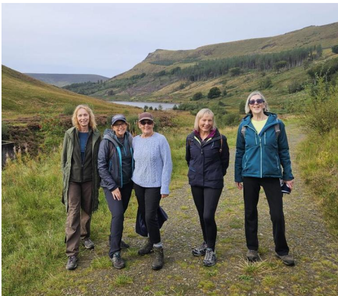
The Big Walk group enjoyed a hike around our namesake reservoir and Yeoman Hey.