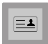
My ID Card