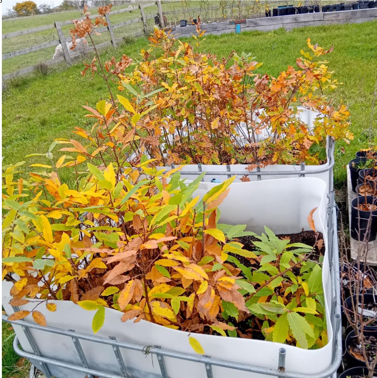
DECEMBER 2025 - SWEET CHESTNUT & OAK FOR HELMINGHAM 'HARRY BEDS' – MOBILE RAISED BEDS