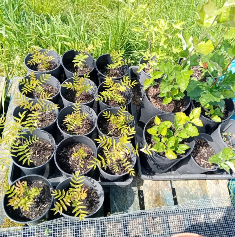
ROWAN & WILD SERVICE May 2025