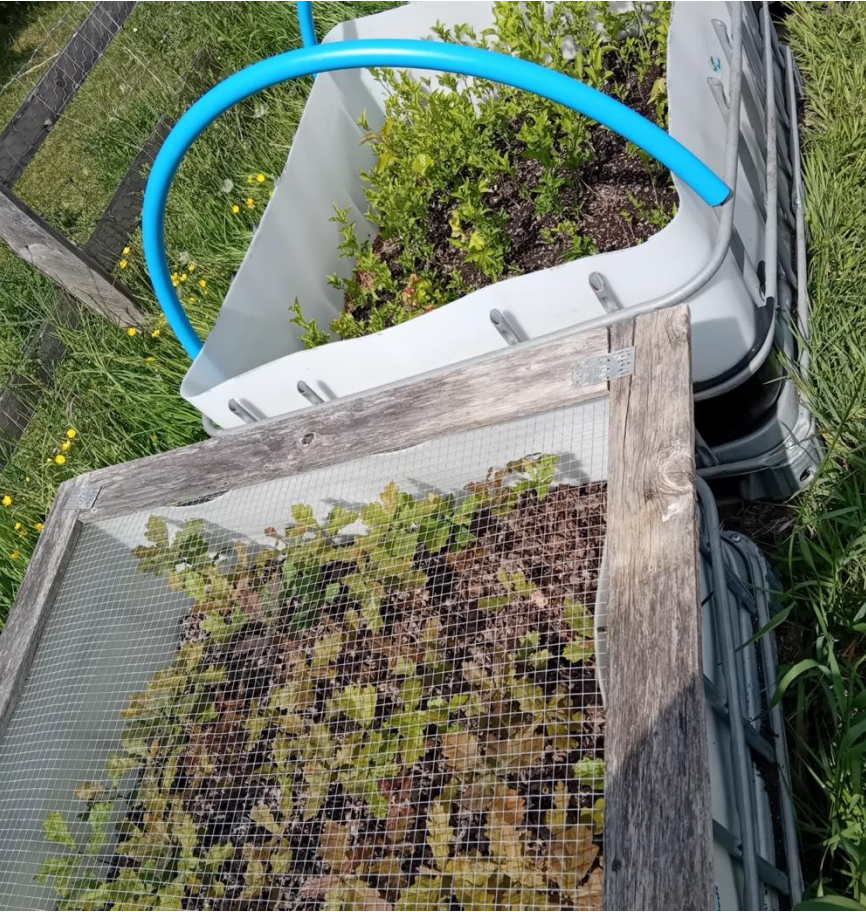
OAK & SPINDLE May 2025