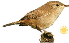
Northern House Wren