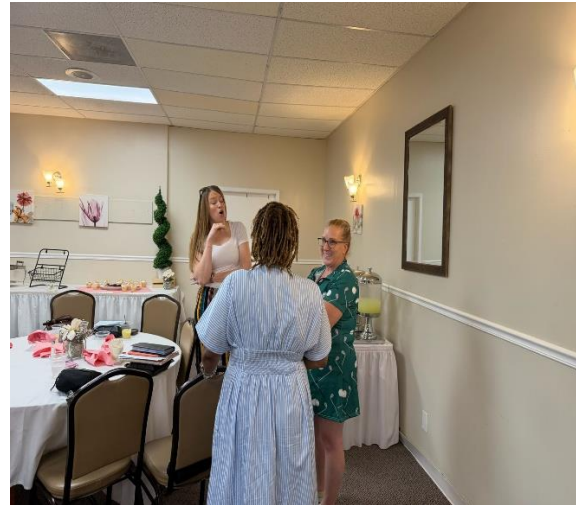
Women's Networking Vibeconnect