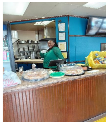
DVHH Music Bingo