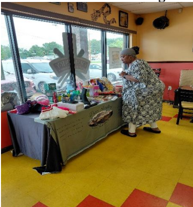
DVHH Music Bingo