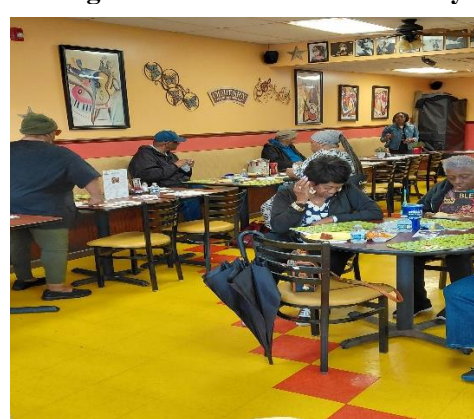
DVHH Music Bingo