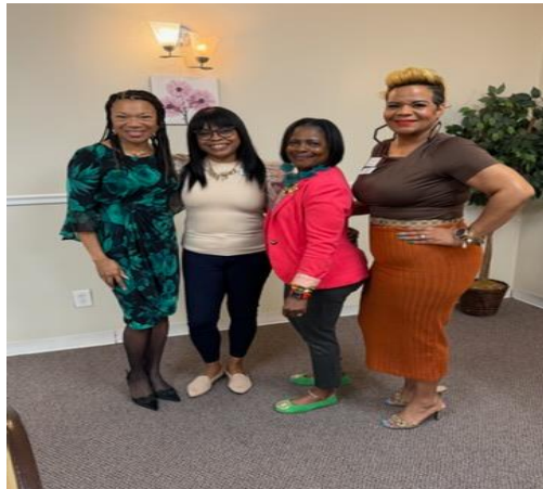
Women's Networking Ambassador's Team