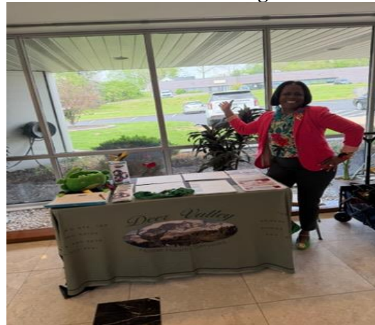
Outreach Tabling at St. Adventist Food Pantry