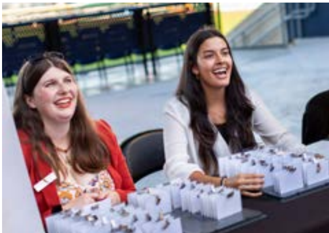
We are motivated by the visible joy shared in these photos captured by Defining Studios.

And to all the Students – WE SEE YOU AND HEAR YOU!