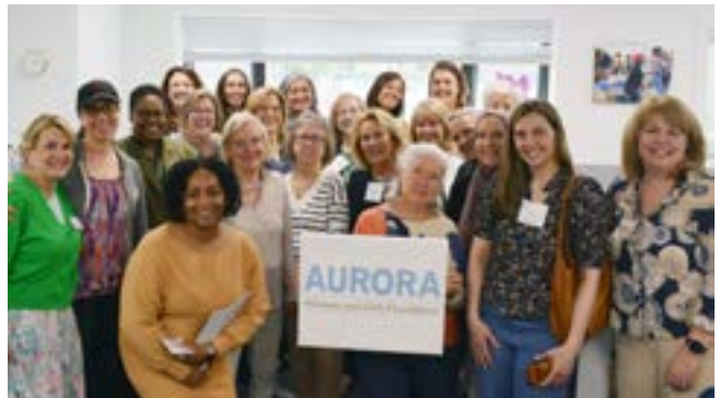
A few of our 49 Giving Circle members