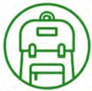
CLEAN KIDS BACKPACK PROGRAM

The Clean Kids Backpack Program is a new ministry of our Future Directions Committee. It provides toiletry items anonymously through local school districts to homeless children attending school. Items needed include soap, shampoo and conditioner, toothpaste and toothbrushes, deodorant, sanitary pads and tampons, combs, hairbrushes, and band aids. This is now an ongoing collection effort so you can give at any time. Please bring items as often as possible to church and place them in the collection bins provided. For those who prefer making a financial donation, a Contribution Fund has been established. Write "Clean Kids" on your donation envelope, or use Online Giving.