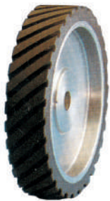
Art. SCANALATA / GROOVED FACE