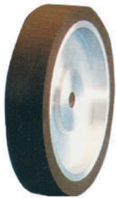
Art. LISCIA / PLAIN FACE