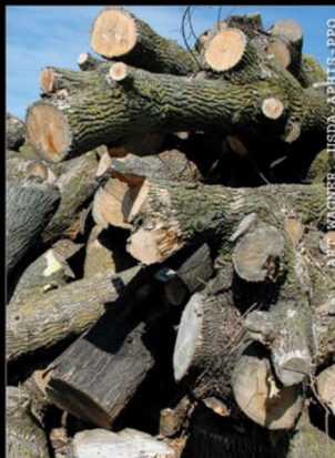
Over 50 million ash killed by emerald ash borer