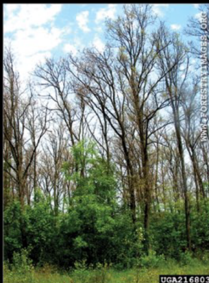
Millions of hardwoods killed by gypsy moth