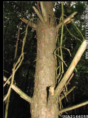
Millions of pines threatened by European wood wasp

Transporting firewood can spread insects and diseases that KILL TREES.