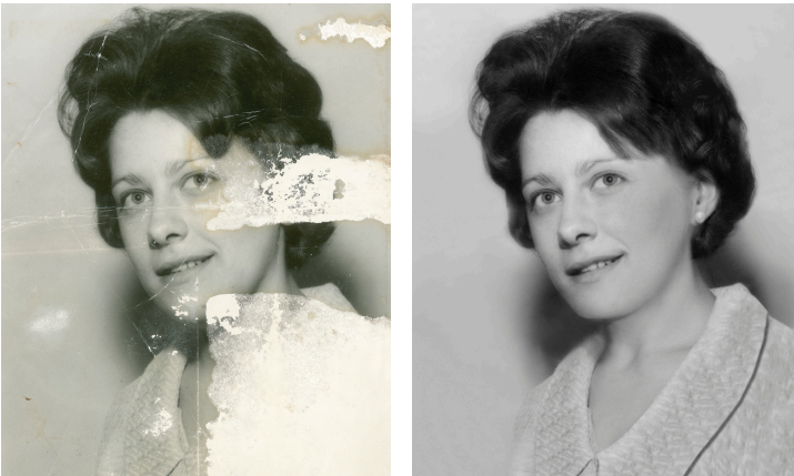
It can require more extensive digital work to retain features, especially if there are parts missing or severely damaged areas.