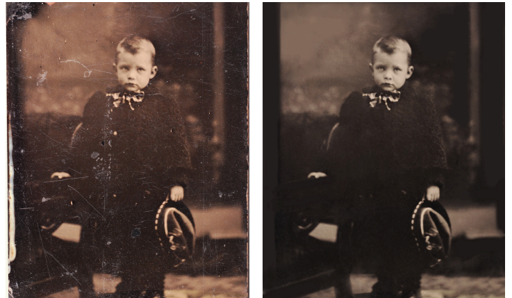
Many old prints just need some colour & density adjustments, dust cleaning and scratch repairs.