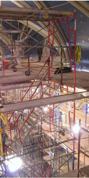
Similar view during 2008 renovations.