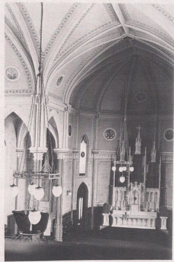
View from the choir loft in 1925

“If every human being possesses an inalienable dignity, if all people are my brothers and sisters, and if the world truly belongs to everyone, then it matters little whether my neighbor was born in my country or elsewhere.”