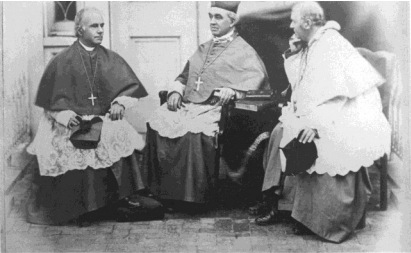
THE FOUNDERS Of the Catholic Church in the North West.