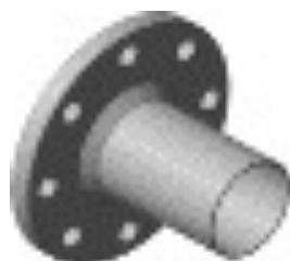
Product Category: Flanged Tip