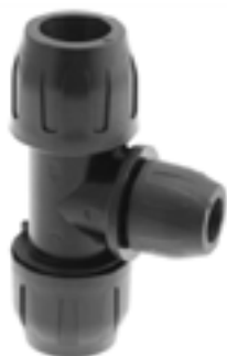
Product Category: Reducing Tee (Technopolymer)