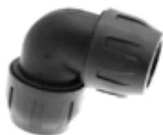
Product Category: 90° Elbow (Technopolymer)