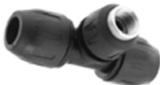
Product Category: Threaded Tee (Technopolymer)