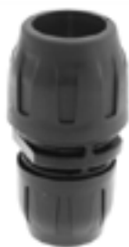
Product Category: Reducers (Technopolymer)