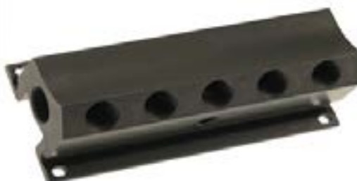
Product Category: Port Manifolds Female Thread (Aluminium)