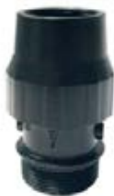
Product Category: Nipple Socket – Male Thread (Aluminium)