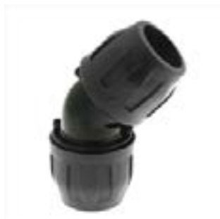
Product Category: 45° Elbow (Technopolymer)