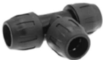
Product Category: Tee (Technopolymer)