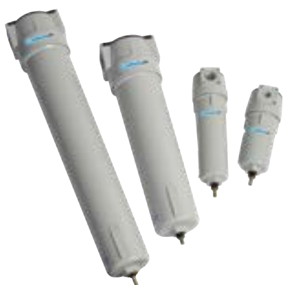
Product Category: FTX Series 0.01 Micron Industrial grade filtration.