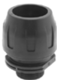
Product Category: Union (Technopolymer)