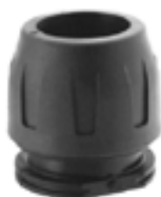
Product Category: End Cap (Technopolymer)