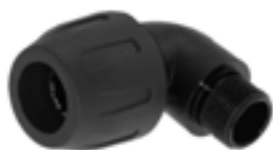
Product Category: 90° Elbow Male Thread (Technopolymer)