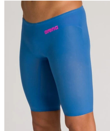
13&O Tech Suit