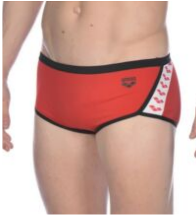
Square Leg Brief