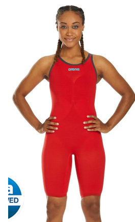
13&O Tech Suit